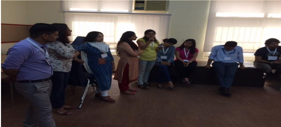
Teachers performing activity on sustainable Goals