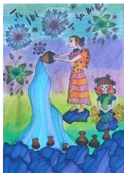
Pratyush lall IX L

The images of the artworks have been attached below.